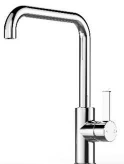
Square Mixer in Chrome

* To order a square mixer change Product code on page 2 from LP to LG