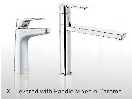
XL Levered with Paddle Mixer in Chrome