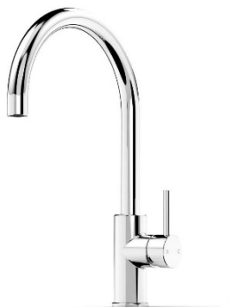
Gooseneck Mixer in Chrome

* To order a square mixer change Product code on page 2 from LP to LG